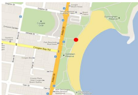
Mon / Wed / Fri

The session meeting spot is halfway along the promenade at the down ramp to the beach. Best to park your car near the Coogee Palace Hotel